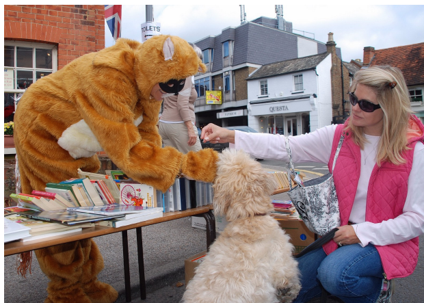
Yours truly being licked by a real dog